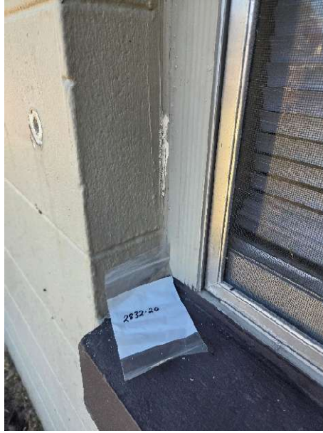
Sample 2832-20 Typical Exterior Caulking Sample