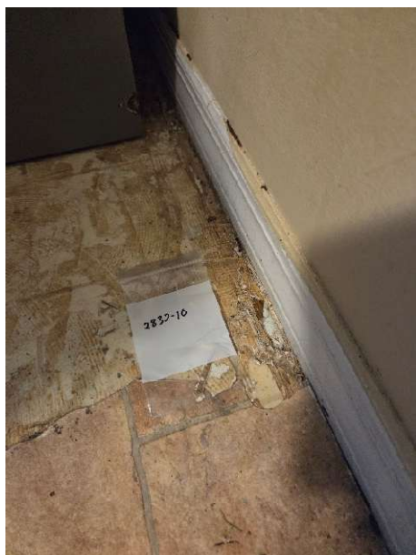
Sample 2832-10 Typical Rolled Vinyl Flooring (Tan) Sample