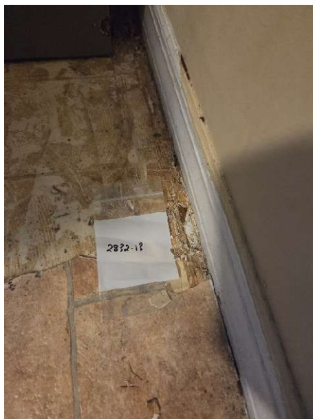
Sample 2832-13 Typical Rolled Vinyl Flooring (Off-White) Sample