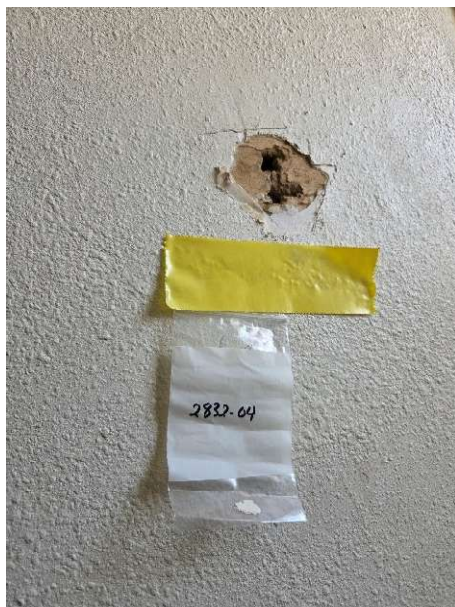
Sample 2832-04 Typical Wall Texture Sample