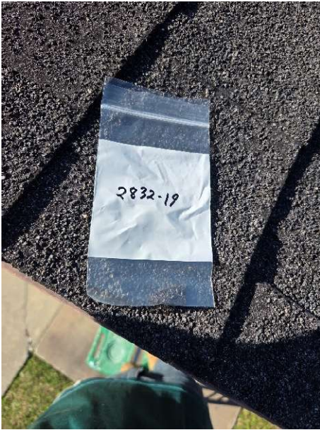
Sample 2832-19 Asphalt Roofing Sample