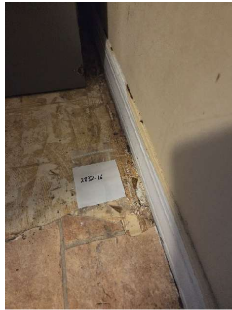
Sample 2832-16 Typical Rolled Vinyl Flooring (Brown) Sample