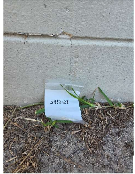
Sample 2832-23 CMU Block Sample