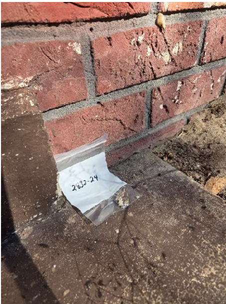
Sample 2832-24 Concrete Sample