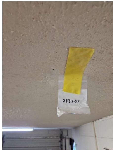
Sample 2832-07 Typical Popcorn Ceiling Texture Sample